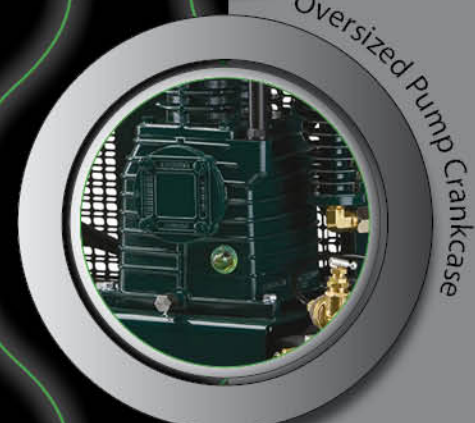
Oversized Pump Crankcase