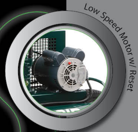
Low Speed Motor w/ Reset